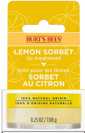
Lip Treatment with Vitamin C (Lemon Sorbet)