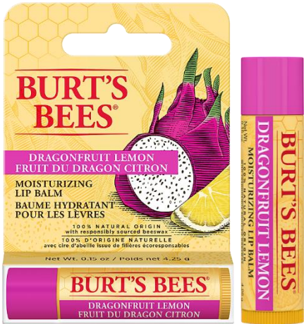
Dragonfruit Lemon Lip Balm (Loose and Carded)