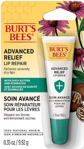
Advanced Relief Lip Repair (carded only)