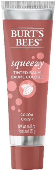
Squeezy Tinted Balm SE (Cocoa Crush)