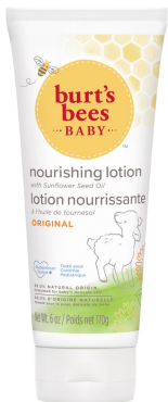
99% Natural Origin

Soften and calm baby's skin with these rich, moisturizing formulas made from natural, nourishing ingredients.