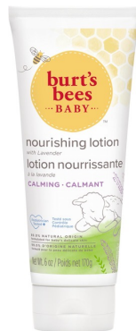
99% Natural Origin