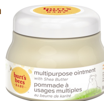
100% Natural Origin