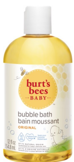
99.8% Natural Origin