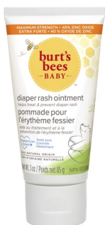
NPN # 80049237