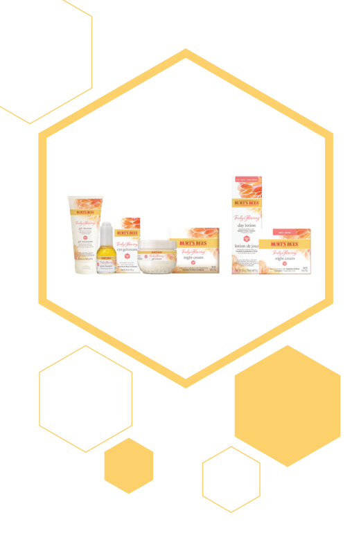
98.9-100% NATURAL ORIGIN