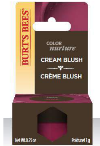
Cream Blush 3 shades