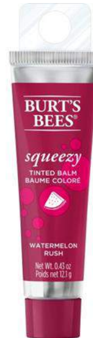
Squeezy Tinted Balm 4 shades