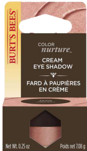
Cream Eyeshadow 3 shades